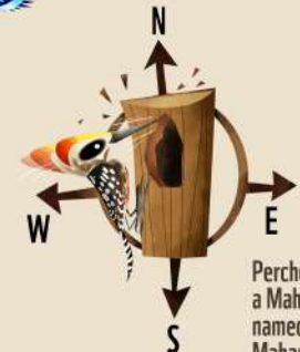
Perched on the compass: a Mahratta Woodpecker, named in honour of Maharashtra